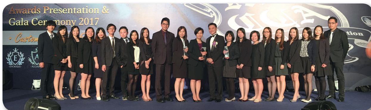
BCT customer contact centre won multiple awards at the Mystery Caller Assessment Award